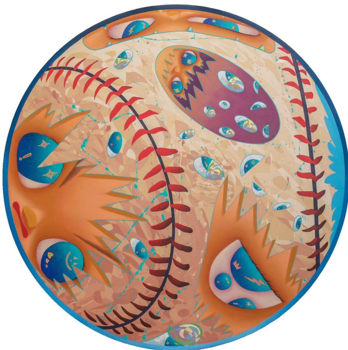
RYOL TITLE : BASEBALL SIZE : D. 150 CM MEDIUM : ACRYLIC ON CANVAS