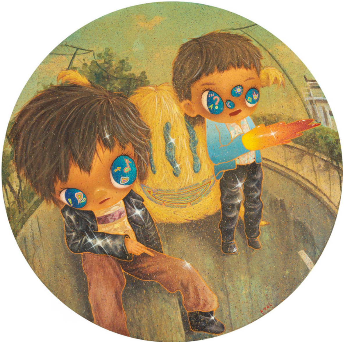
RYOL TITLE : THE GANG IN FISHEYE ANGEL SIZE : D. 80 CM MEDIUM : ACRYLIC ON CANVAS